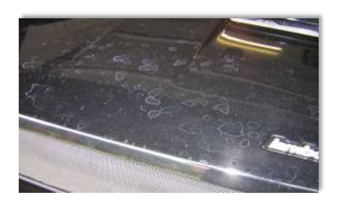
Avoid limescale on showers and taps